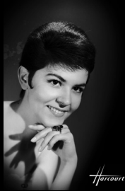
Georgette Rispal 1963