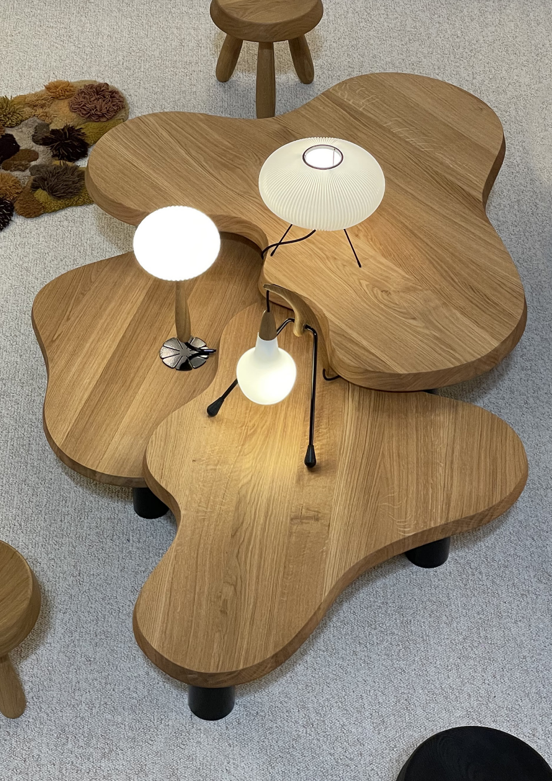
N° 15.022 / Flower M&S versions