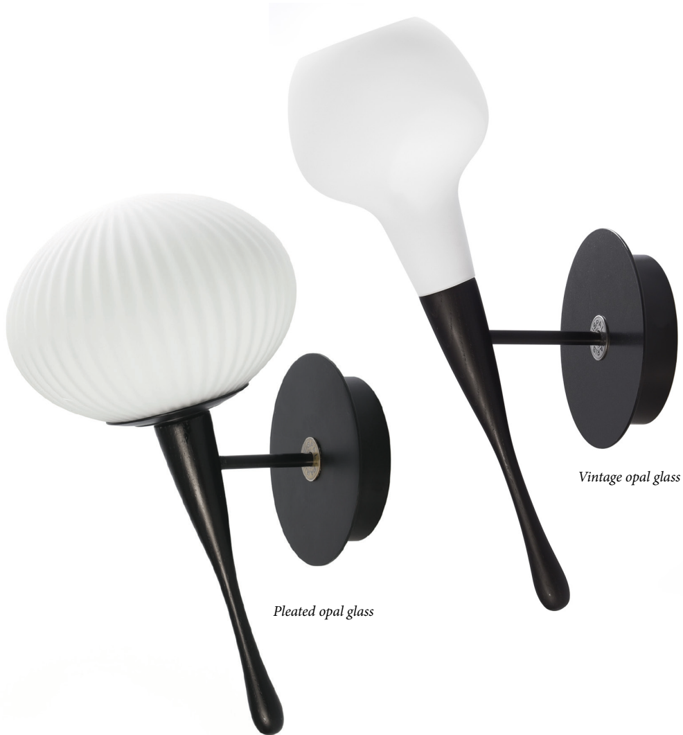
Pleated opal glass