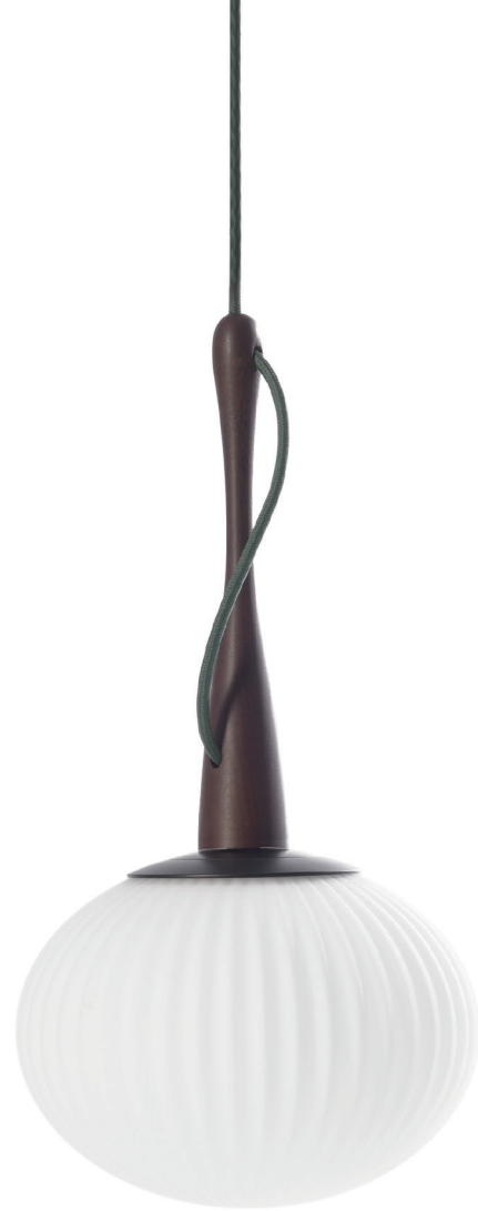
N° 11.022 / La Torche CM Pleated opal glass