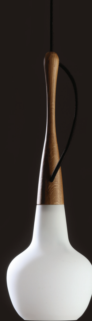
N° 11.100 / La Torche CM Vintage opal glass