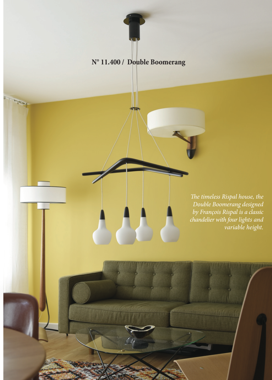
The timeless Rispoli house, the Double Boomerang designed by François Rispoli is a classic chandelier with four lights and variable height.