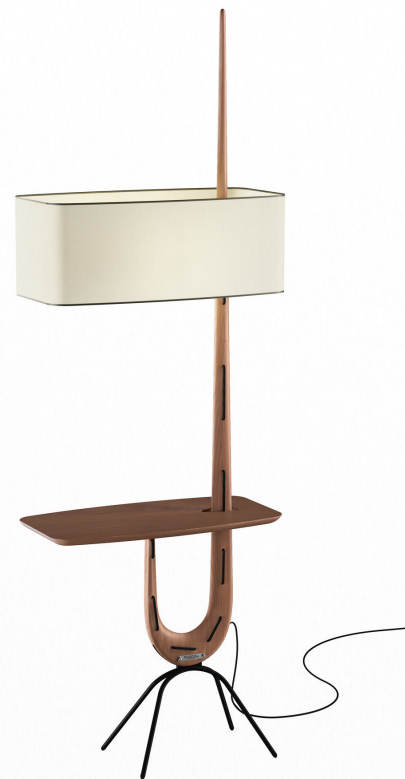
14.952 Girafe à tablette coming soon