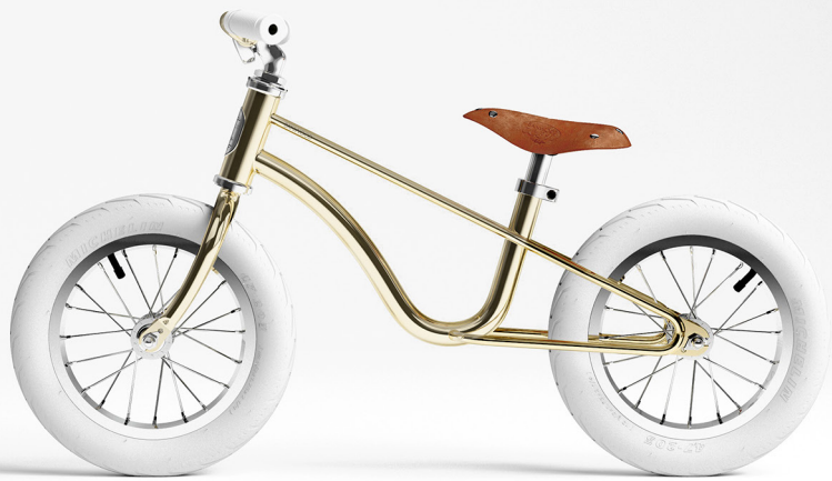
Balance bike, limited edition Rispal X Banwood