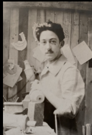
Georges Rispal 1925