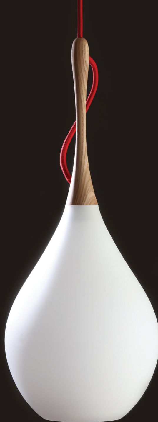
N° 11.110 / La Goutte