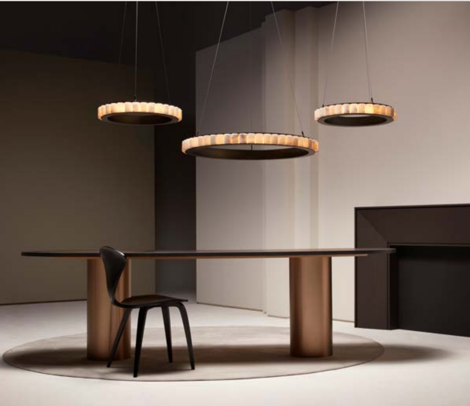
AVALON CHANDELIER | BRONZE