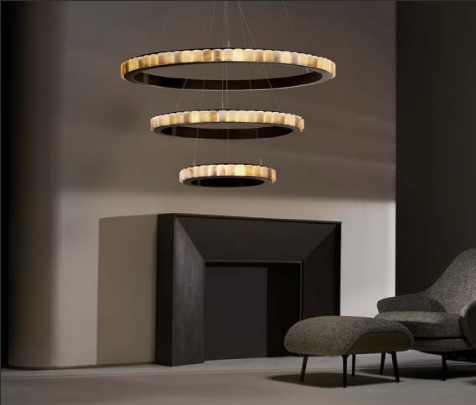
AVALON TRIPLE | BRONZE