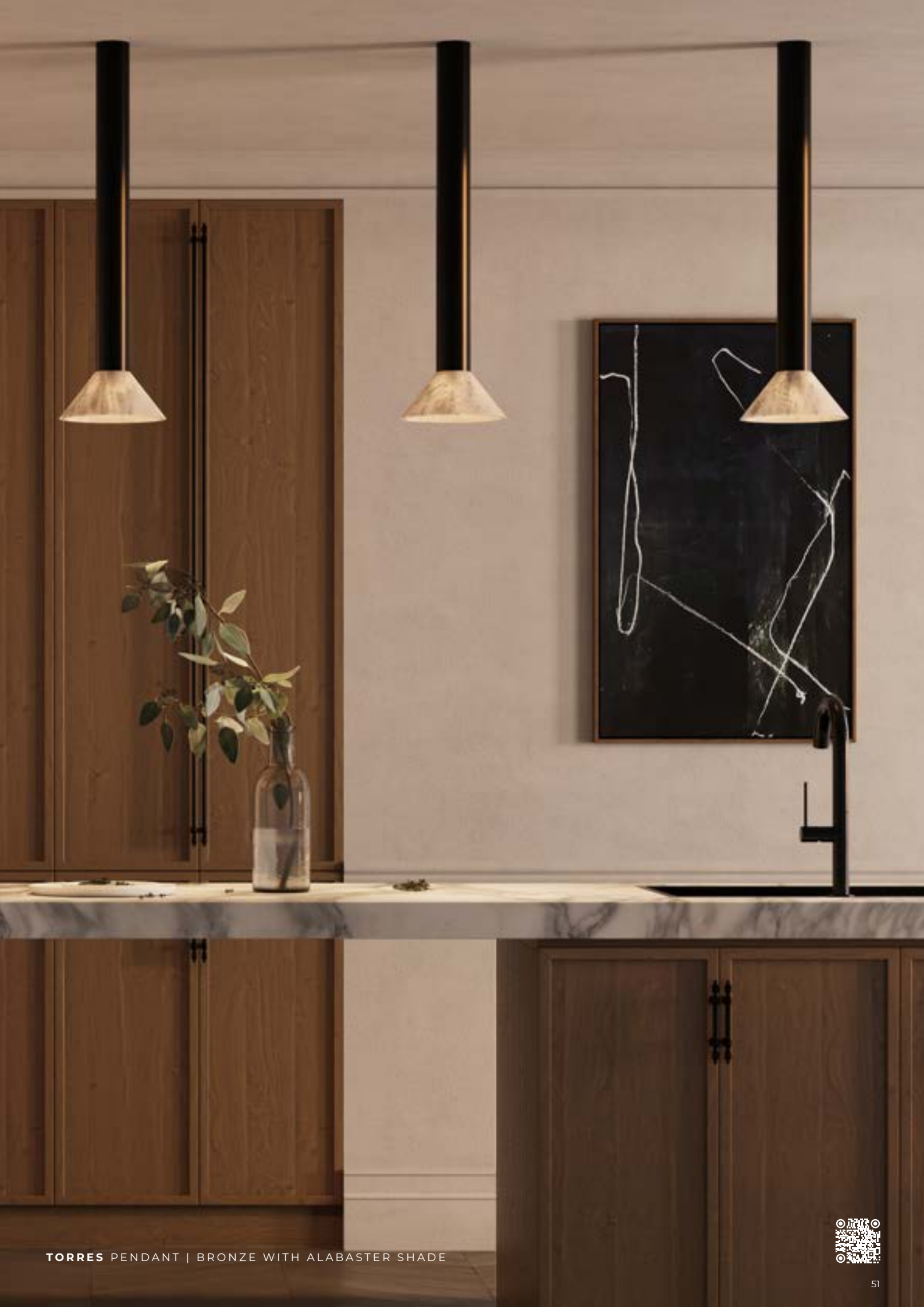
TORRES PENDANT | BRONZE WITH ALABASTER SHADE