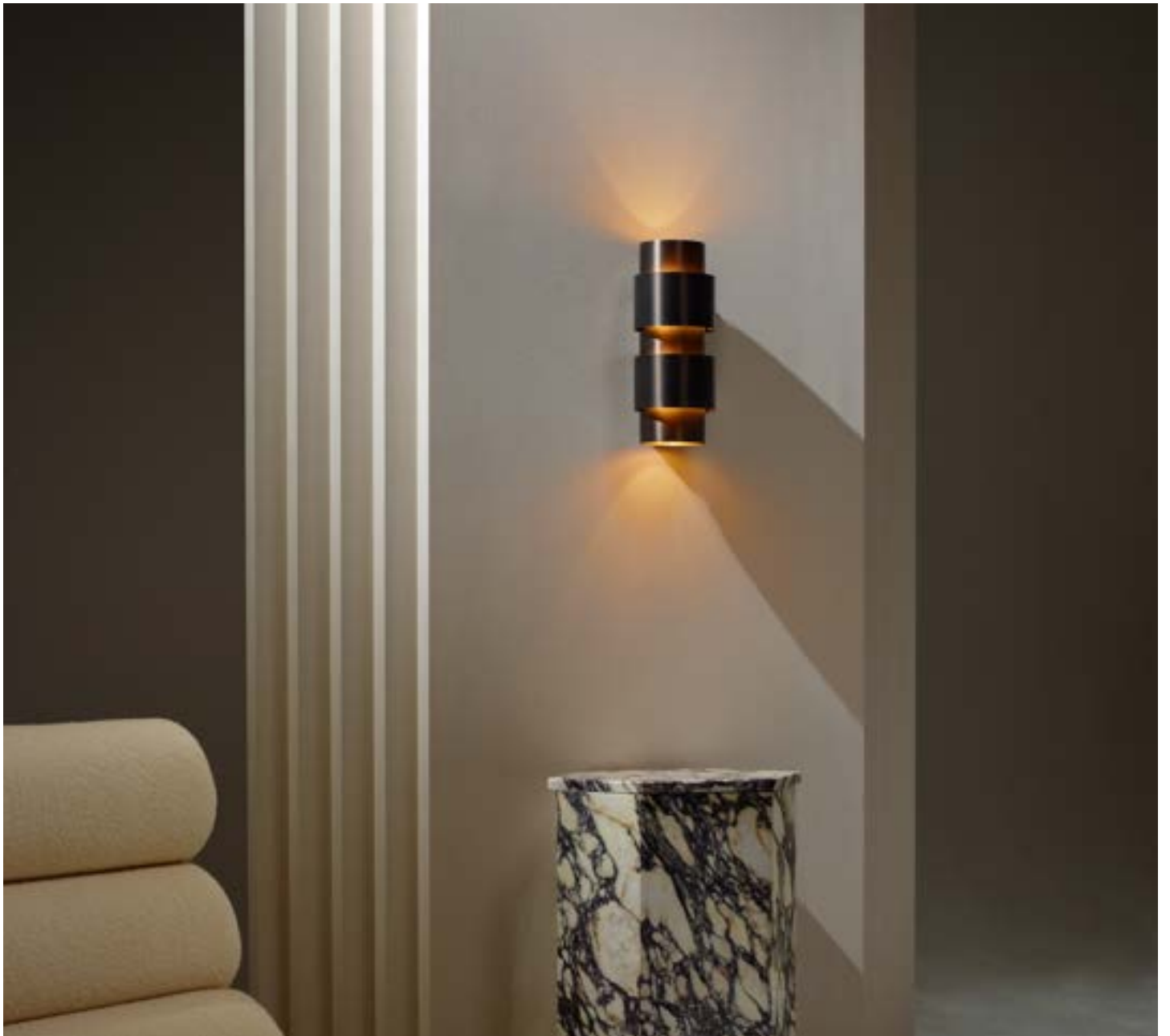
RING WALL | BRONZE