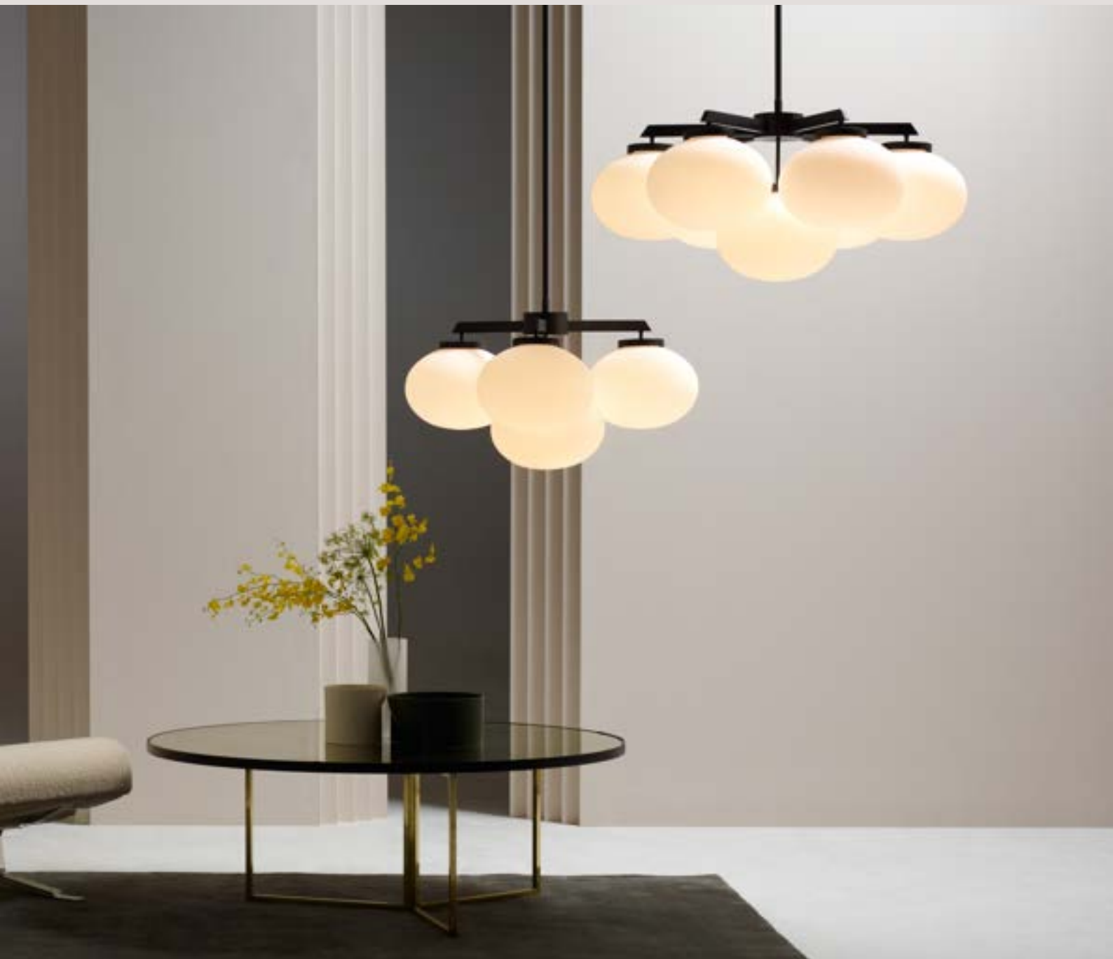
CLOUDESLEY CHANDELIER | BRONZE