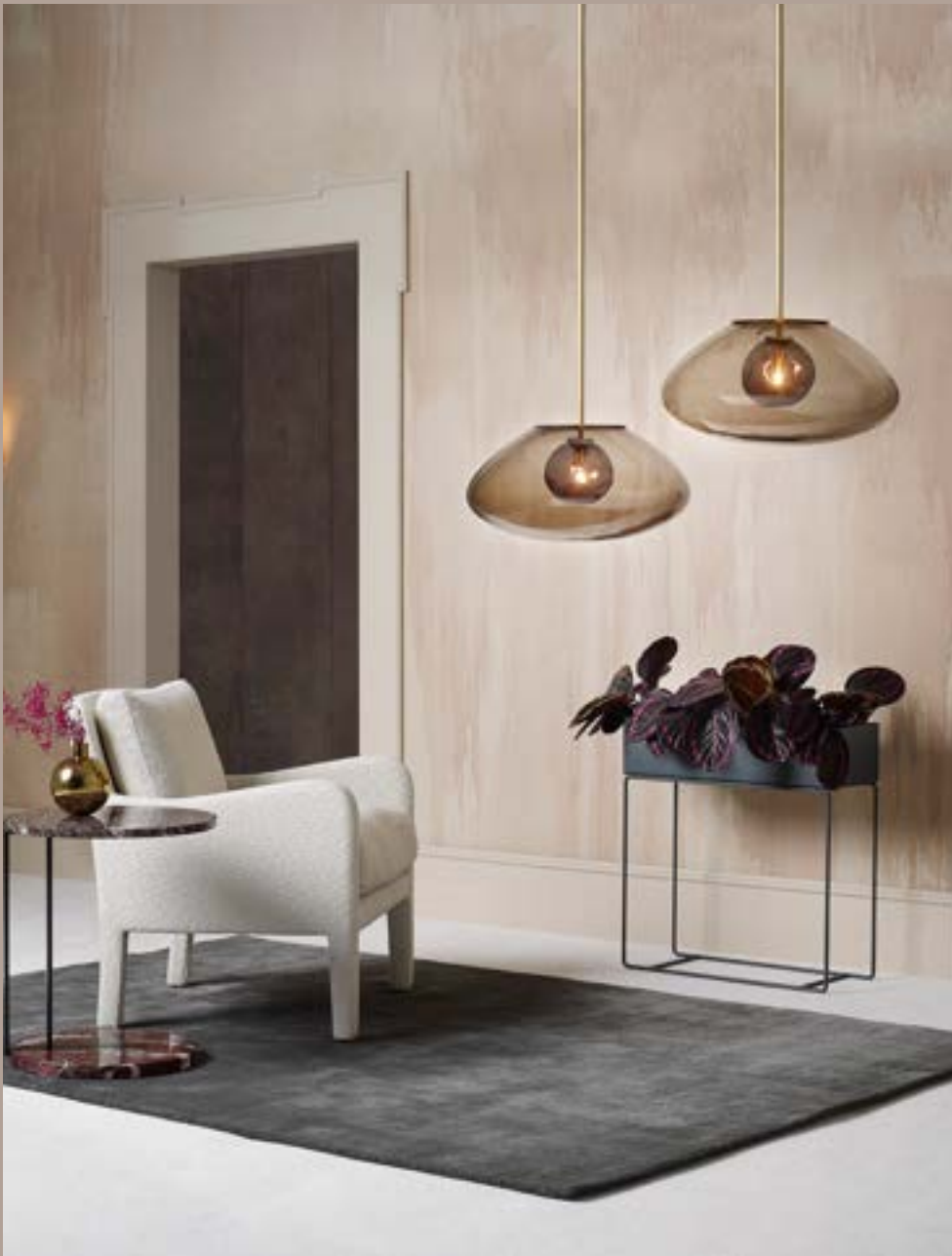
PETRA PENDANT | LARGE | SATIN BRASS WITH SMOKED INNER CORE