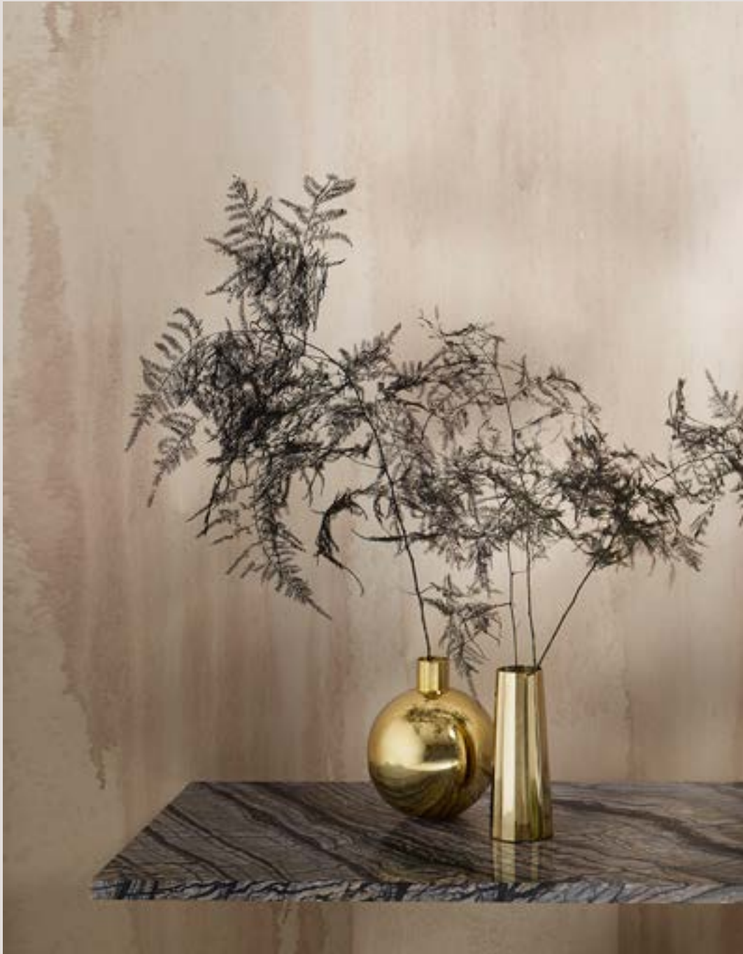
PETRA PENDANT | LARGE | SATIN BRASS WITH SMOKED INNER CORE