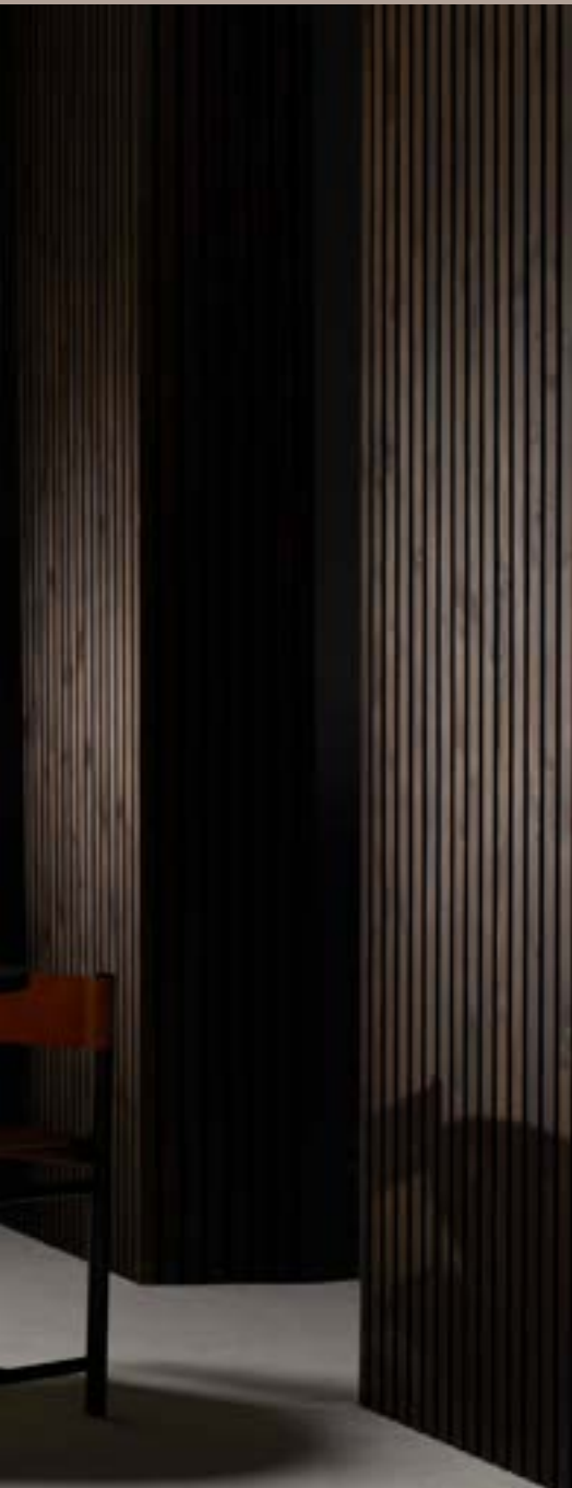
MODULO HORIZONTAL | BRONZE