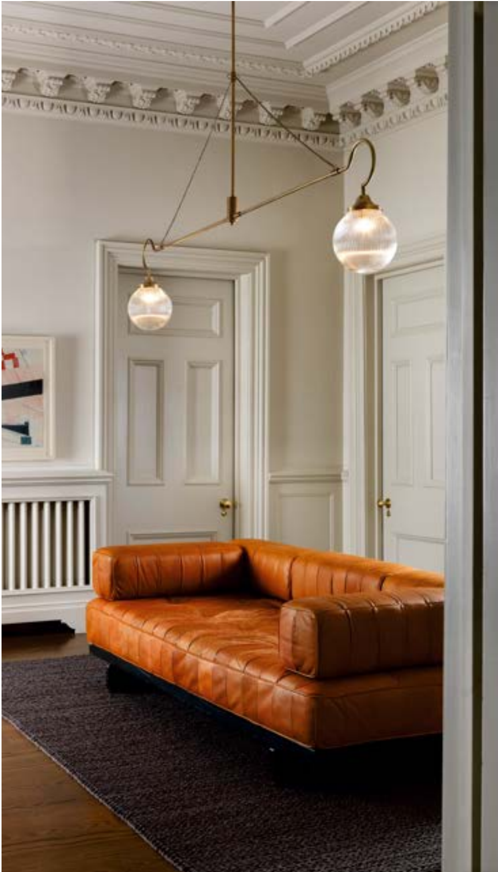
FLOREN 2 PENDANT

Inspired by the arts and crafts movement. Contrasting metal chains both support the structure and add decoration to the light.