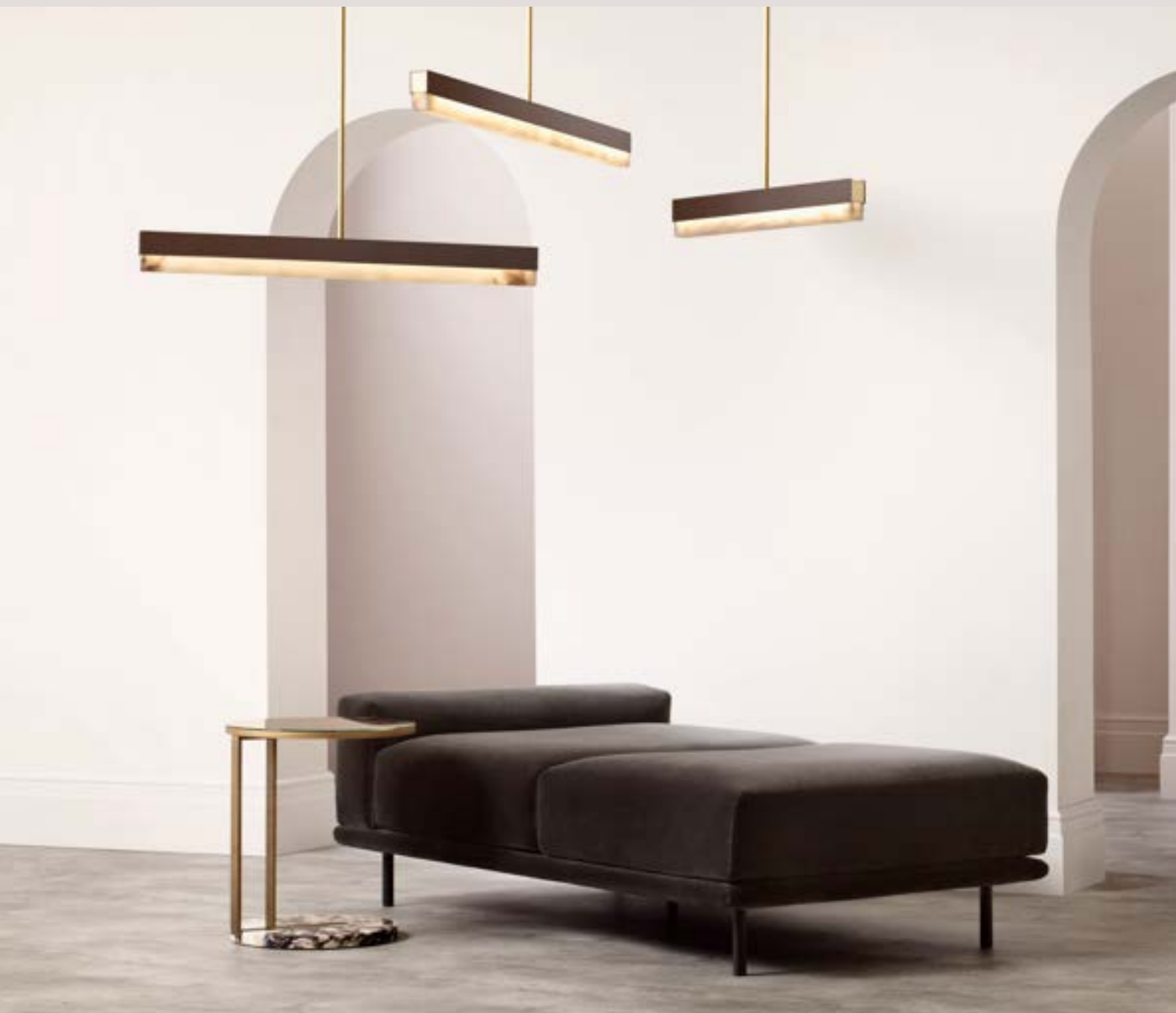
ARTÉS PENDANT | BRONZE