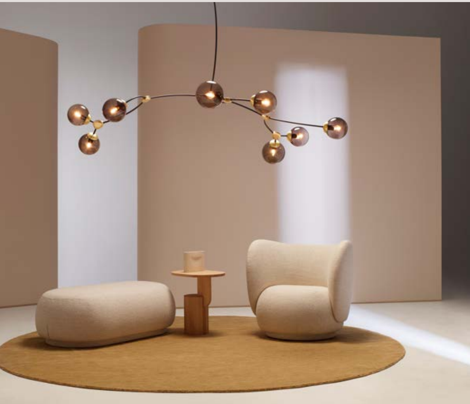
IVY 8 PENDANT | SMOKED GLASS