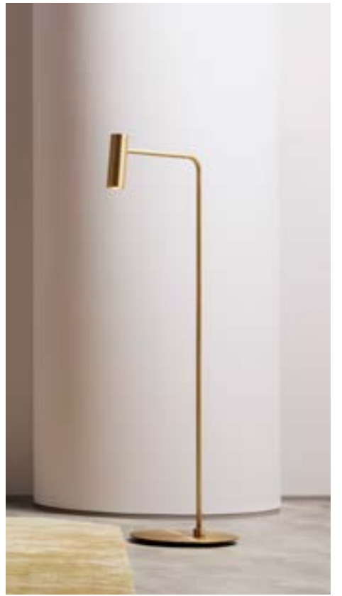
HERON FLOOR | SATIN BRASS