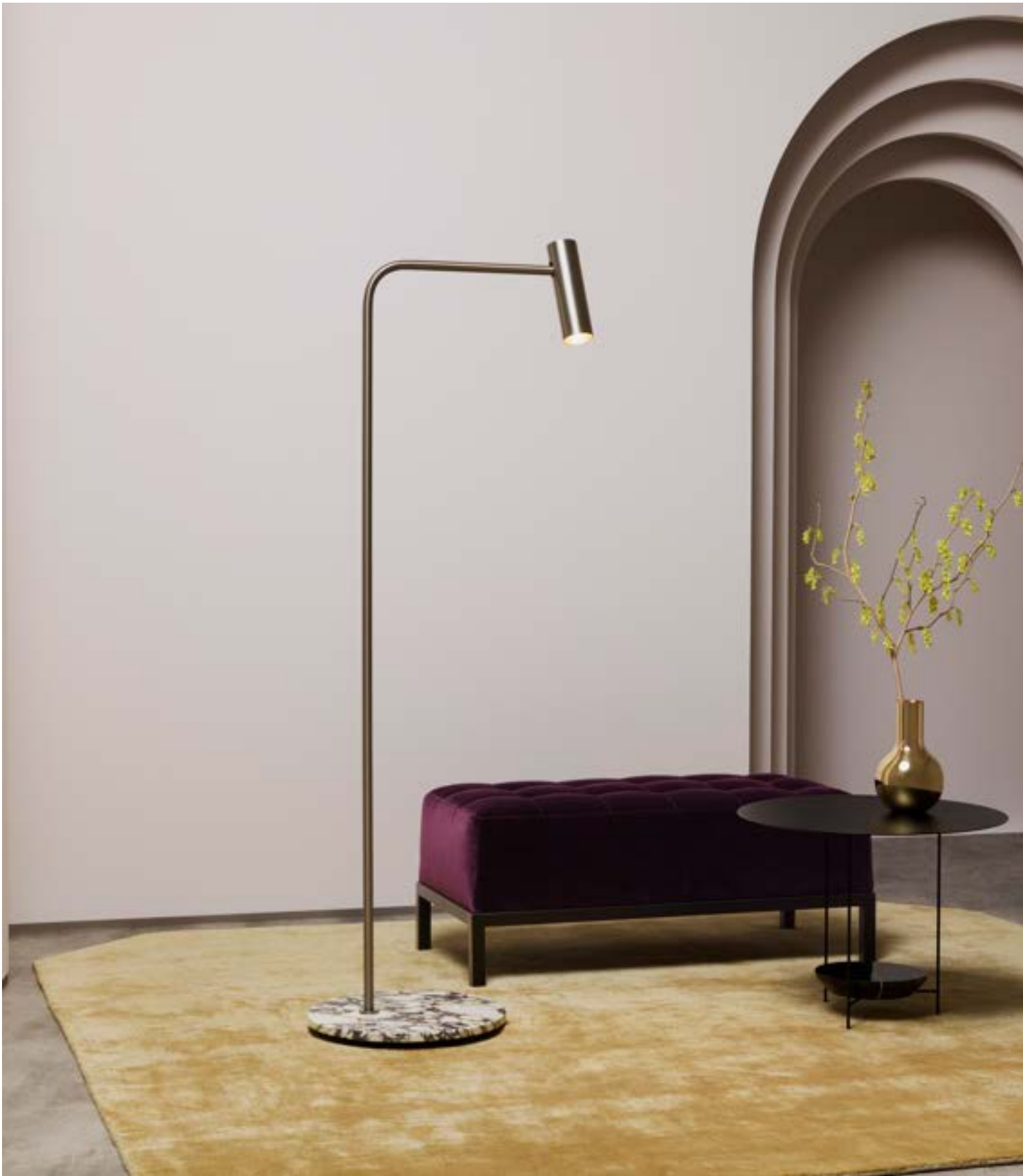
HERON FLOOR | BRONZE WITH CALACATTA VIOLA MARBLE BASE