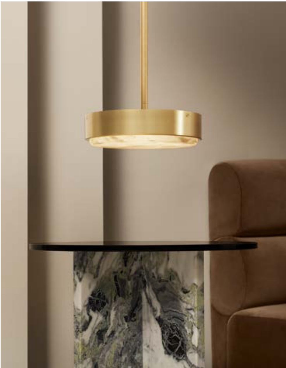
ANVERS PENDANT | SMALL | SATIN BRASS