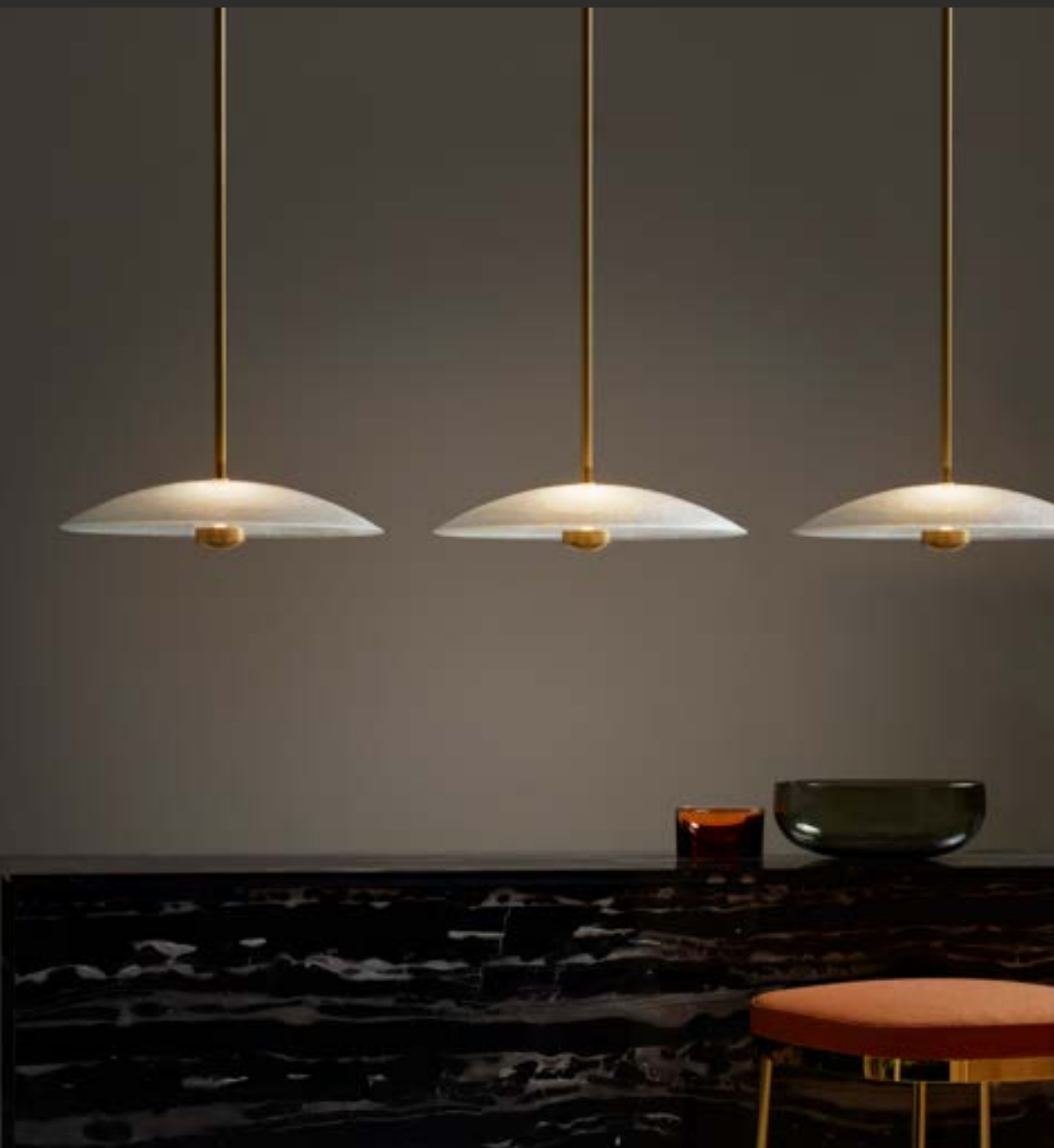
CIELO PENDANT | SATIN BRASS