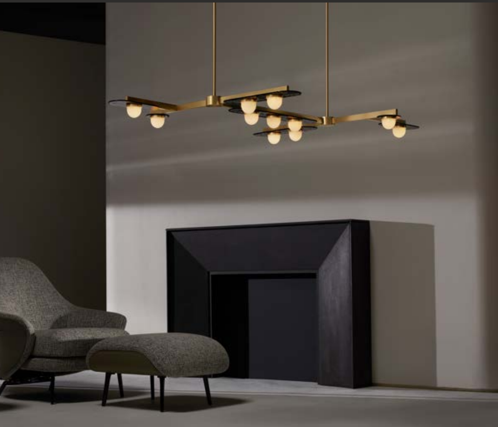
MODULO GRID 11 | SATIN BRASS