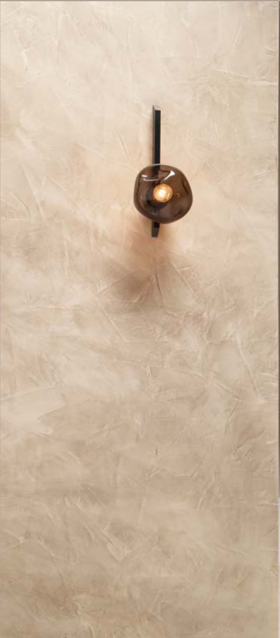
GAIA WALL | BRONZE WITH HAND SHAPED SMOKED GLASS SHADE