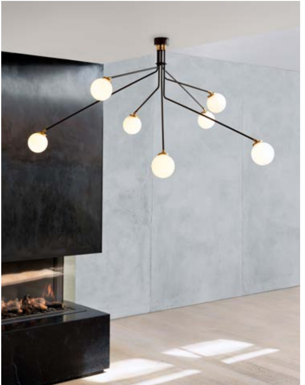
ARRAY OPAL PENDANT