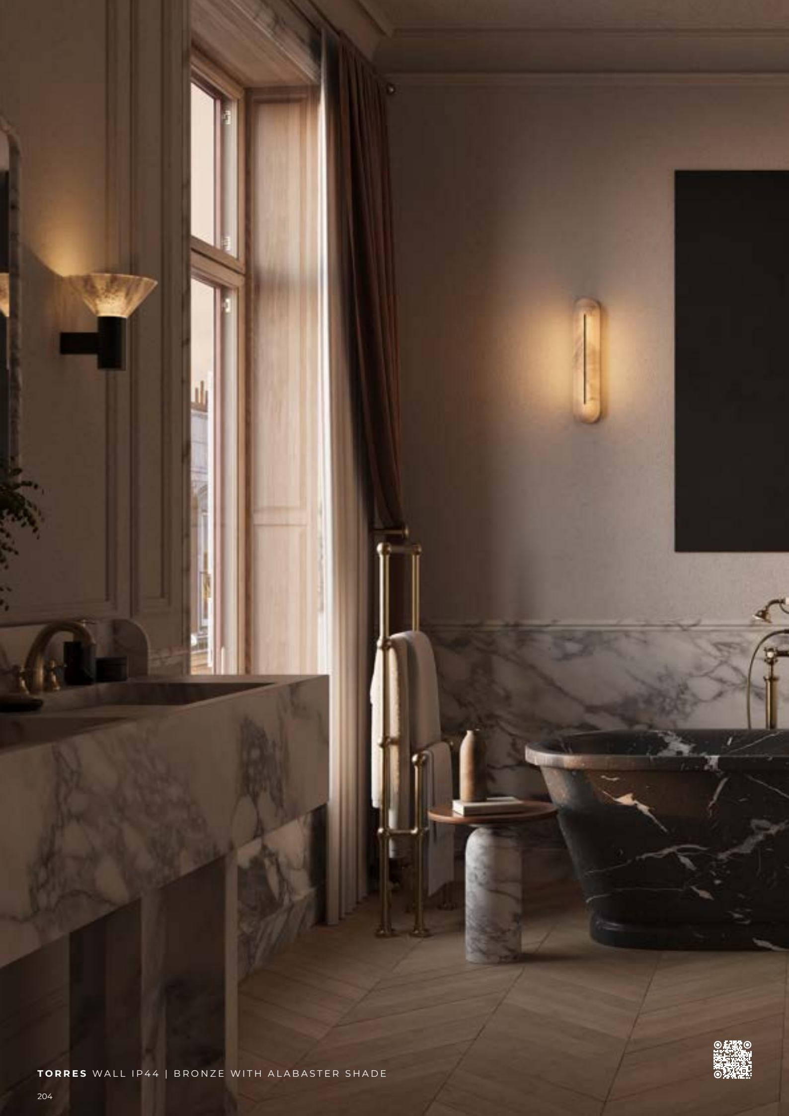
TORRES WALL IP44 | BRONZE WITH ALABASTER SHADE