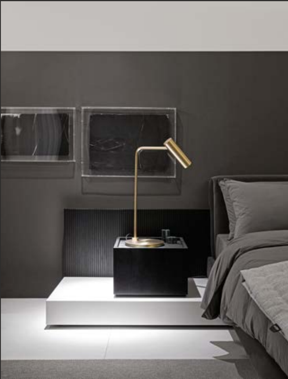
HERON TABLE | SATIN BRASS