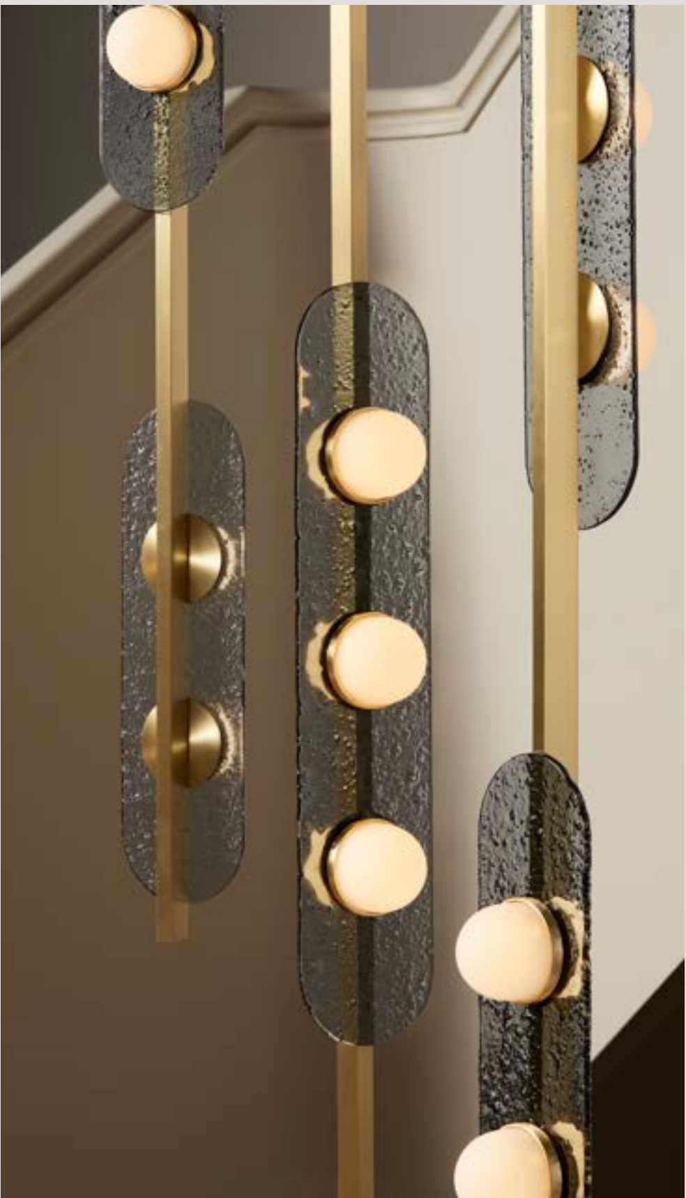
MODULO VERTICAL | SATIN BRASS